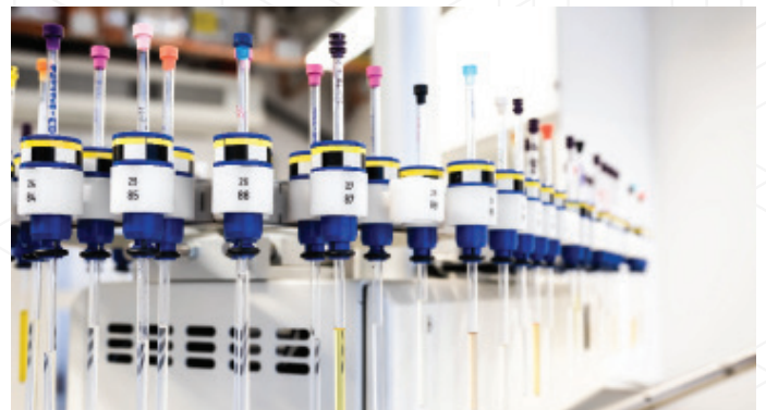
Analysis in UV for life science applications.